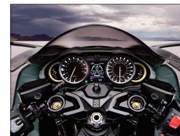
The beauty of fine instrumentation