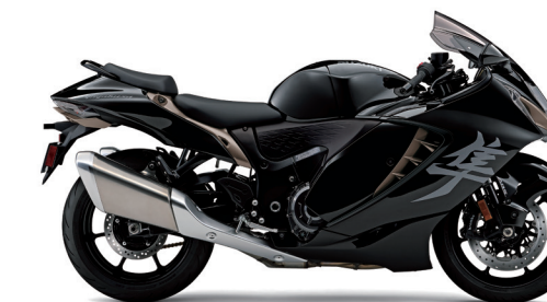
Glass Sparkle Black / Metallic Mat Titanium Silver (BLG)