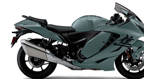
Metallic Mat Steel Green / Glass Sparkle Black (COT)