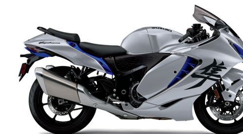
Metallic Mystic Silver / Pearl Vigor Blue (ASU)