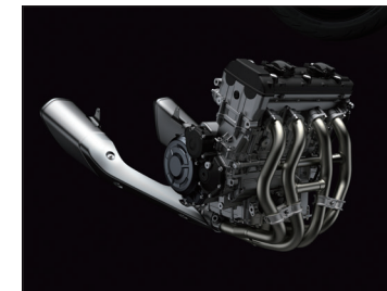
1,340cm 3 liquid-cooled inline-four engine