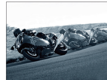
Suzuki Intelligent Ride System (S.I.R.S.)

* The images include an optional accessory.