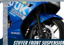
STIFFER FRONT SUSPENSION