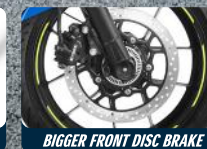
BIGGER FRONT DISC BRAKE