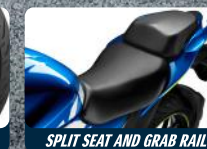
SPLIT SEAT AND GRAB RAIL