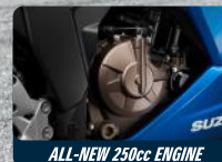
ALL-NEW 250cc ENGINE