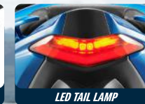
LED TAIL LAMP