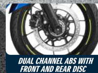
DUAL CHANNEL ABS WITH FRONT AND REAR DISC