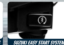
SUZUKI EASY START SYSTEM