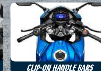
CLIP-ON HANDLE BARS