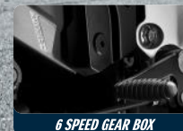
6 SPEED GEAR BOX