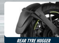
REAR TYRE HUGGER