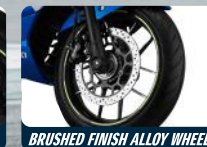
BRUSHED FINISH ALLOY WHEELS