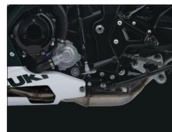
Bi-directional Quick Shift System

GSX-R1000R logo on the tail alerts others that this motorcycle is something extraordinary.