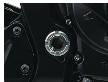
Swing Arm Pivot