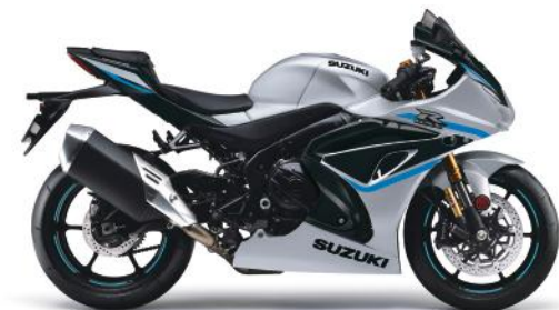
Metallic Mat Sword Silver (QKA)