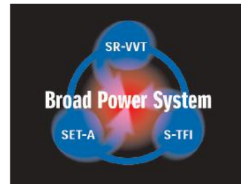
Broad Power System

The GSX-R1000R-specific, black background LCD multifunction instrument panel was inspired by racing models. The unique