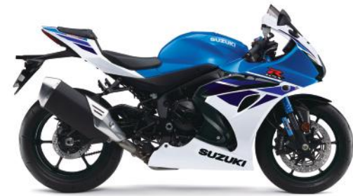
Pearl Brilliant White / Metallic Triton Blue (BQJ)