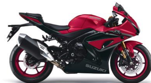
Candy Daring Red / Glass Sparkle Black (AV4)