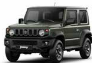
Jungle Green (Z2C)

■ Single-tone colours Five basic colours are available as single-tone body colours