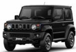
Bluish Black Pearl 3 (Z13)