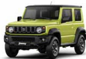
Kinetic Yellow + Bluish Black Pearl 3 (DG5)

■ Two-tone colours Three combinations of two-tone colouring are available