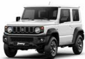
Superior White (26U)