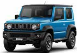
Brisk Blue Metallic + Bluish Black Pearl 3 (C2W)