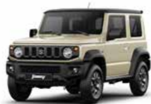
Chiffon Ivory Metallic + Bluish Black Pearl 3 (2BW)

■ Single-tone colours Five basic colours are available as single-tone body colours